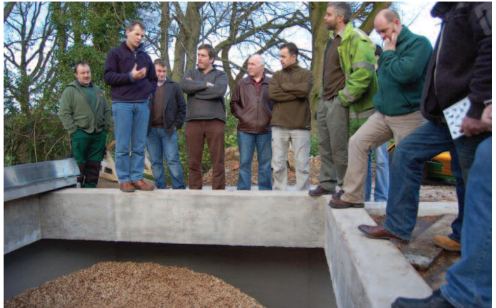
Woodfuel training with Ignite.

Companies, colleges and organisations looking to offer woodland and woodfuel management training in the Eastern region can now claim up to 65% towards delivering those courses for eligible participants - thanks to Woodfuel East.